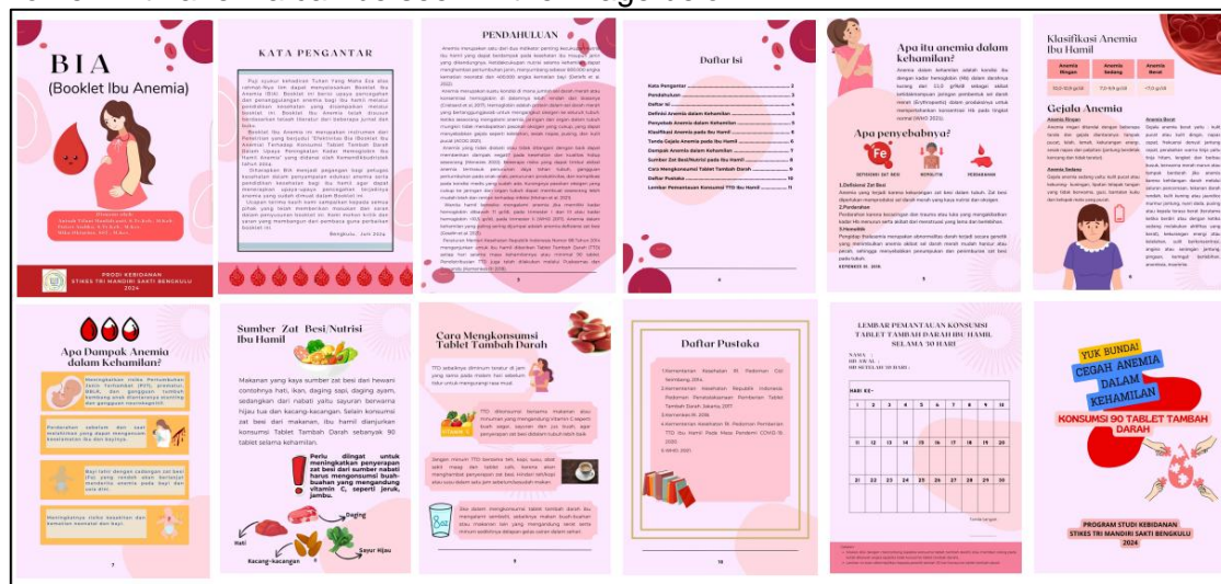
Figure 1. Booklet Ibu Anemia (BIA)

The research type was quantitative with a quasi-experimental pretest and posttest with a control group design to determine whether there are changes in hemoglobin levels and behavior before and after the intervention of the booklet for pregnant women with anemia. The booklet for pregnant women with anemia is a mentoring method using a booklet containing educational materials about anemia during pregnancy and how to consume iron tablets. The design of the BIA begins with identifying the problem analysis and material needs for the booklet's content. Then, the material is compiled into a booklet. After the BIA is compiled, the researcher conducts a validation test by booklet material experts and language experts on the booklet's content. The booklet for pregnant women with anemia can be seen in the image below.